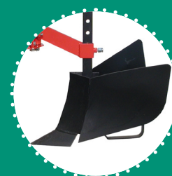
RIDGING PLOW with adjustable wings