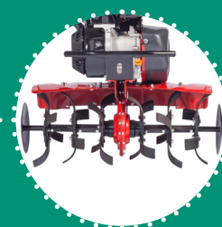
ROTAVATOR bolted knives Ø33 cm 82 cm can be reduced to 58 cm with discs