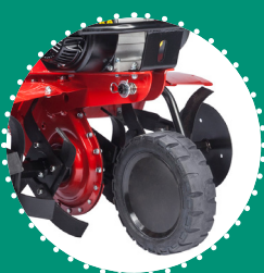
TRANSPORT WHEEL quick tilting