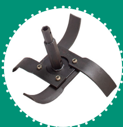
ROTAVATOR EXTENSION work width 105 cm