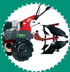
LABOUR PRO KIT 5.00-10" wheels + Ratchets 2 ballast wheels 20 kg each front ballast 15 kg swivel plough