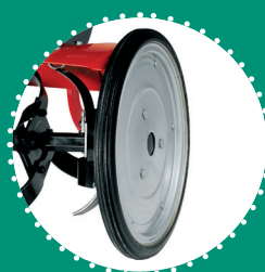
TRANSPORT WHEELS to be assembled on discs