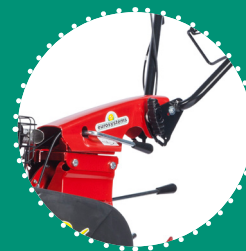
HANDLEBAR vertically and laterally adjustable