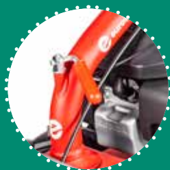
HANDLEBAR vertically and laterally adjustable