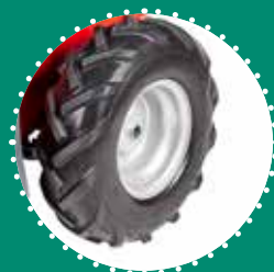
DRIVEN WHEELS puncture proof 13x5.00-6"