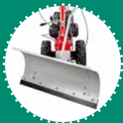
SNOW BLADE 85 cm adjustable \pm 30^\circ