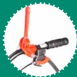
LEVERAGES traction + tool coupling with integrated safety system