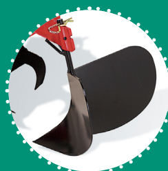
RIDGING PLOW with fixed wings