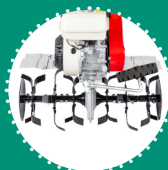
ROTAVATOR bolted knives Ø32 cm 75 cm can be reduced to 50 cm with discs