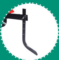
SPUR with 4 adjustments