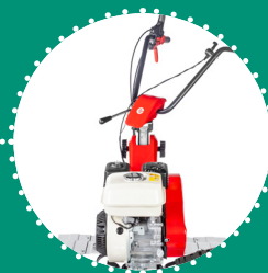
HANDLEBAR vertically and laterally adjustable