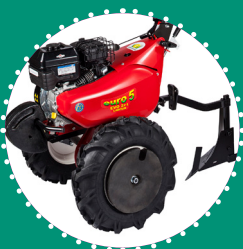
LABOUR CLASSIC KIT wheels 5.00-10" + fixed axles 2 ballast wheels 20 kg each front ballast 15 kg classic plough