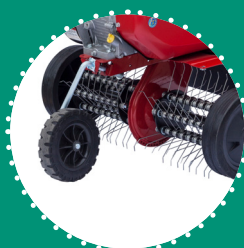
AERATOR spring-type, 50 cm