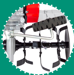
TRANSPORT WHEEL quick-lift frontal